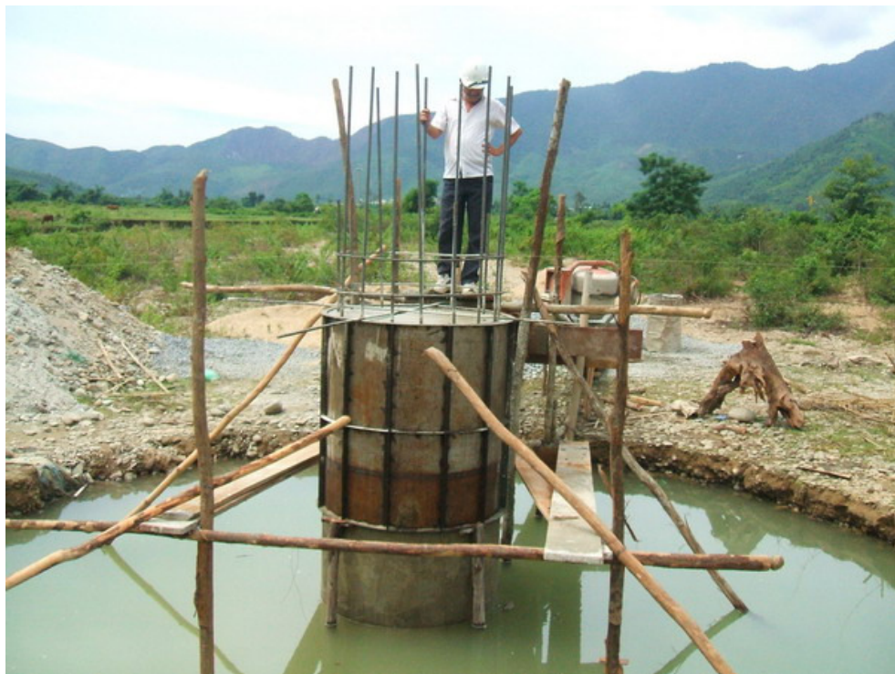
4. Checking the form-work (September 01, 2007)